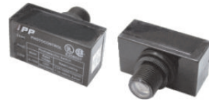
Optional photo control