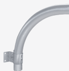
Aluminum anodized arm