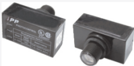
Optional photo control